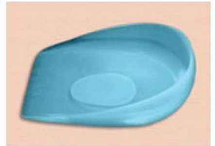
Soft heel pads can provide extra support.

Complication rates for gastrocnemius recession are low, but can include nerve damage.